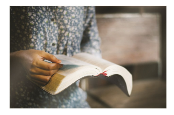
Excerpts from the Lectionary for Mass ©2001, 1998, 1970 CCD. The English translation of Psalm Responses from Lectionary for Mass © 1969, 1981, 1997, International Commission on English in the Liturgy Corporation. All rights reserved.

Gn 9:8-15/Ps 25:4-5, 6-7, 8-9 (see 10)/ 1 Pt 3:18-22/Mk 1:12-15