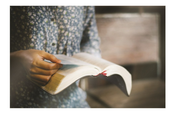
Excerpts from the Lectionary for Mass ©2001, 1998, 1970 CCD. The English translation of Psalm Responses from Lectionary for Mass © 1969, 1981, 1997, International Commission on English in the Liturgy Corporation. All rights reserved.

Gn 22:1-2, 9a, 10-13, 15-18/Ps 116:10, 15, 16-17, 18-19 (116:9)/Rom 8:31b-34/ Mk 9:2-10